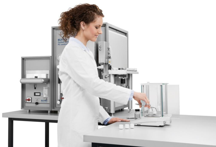
Fig. 3: ELTRA's CS-2000 features the unique Dual Furnace Technology

Alternative procedures permitted by the standard include the use of elemental analyzers with induction furnace (Eltra CS-800) or resistance furnace (Eltra CS-580) as well as detection with infrared cells. A combination of the two combustion technologies and a combined usage of the detectors have been realized in Eltra's CS-2000 analyzer (fig. 3).