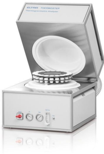
Fig. 1: ELTRA's thermogravimetric analyzer Thermostep

Thermogravimetric analyzers which are equipped with a combination of furnace and balance considerably simplify the manual procedure. Usually, these analyzers have an interior chamber which can be heated up to 1,000 °C and a separate weighing cell in the analysis chamber which is connected with the furnace by a ceramic pedestal. A rotating carousel places up to 19 different samples, one after the other, on the pedestal to be weighed. The market offers thermogravimetric analyzers for both small sample quantities (e. g. 20 mg) and quantities of 5 g or more (such as Eltra's Thermostep, fig. 1). By using an empty reference crucible, thermal buoyancy is compensated and measurements can be carried out reliably even at high temperatures. The ceramic crucibles usually have a volume of 12 ml, allowing for sample weights of up to 5 g. This, however, is not very practical due to the high filling level. So far, the DIN EN ISO 21068-2 standard does not mention automated thermogravimetric analysis.