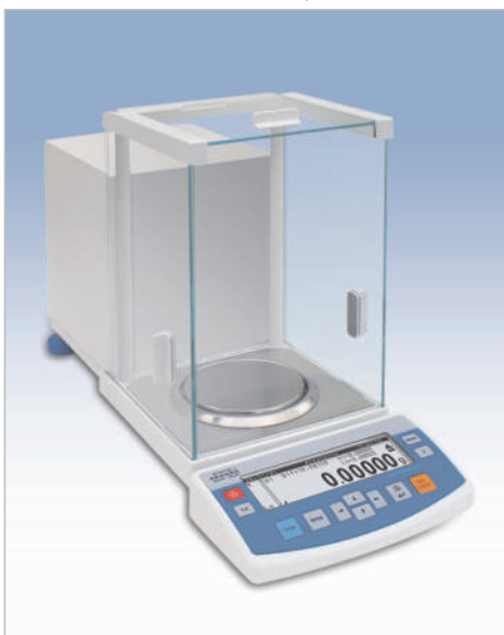
XA/X series- professional level analytical balances

XA/X balances are equipped with big backlit graphic display with extended menu, 12-keys membrane keyboard, big weighing chamber with sliding upper glass door and side glass door.