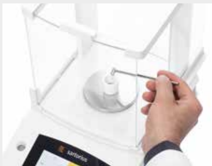
Weighing the sample

weighed and logged into the software, all further steps happen automatically once the analysis is started. The results are available within minutes.