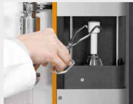
Introducing the sample