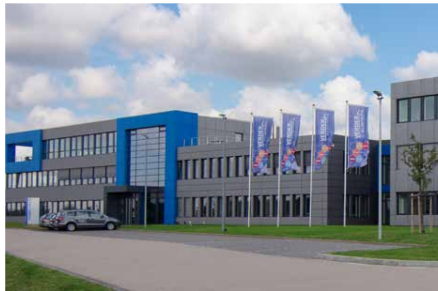
Eltra GmbH in Haan, Germany

ELTRA is part of the Verder Group since 2012 and consistently invests in research and development. With the introduction of the ELEMENTRAC series with powerful ELEMENTS software ELTRA offers analyzers for rapid and reliable O/N/H and C/S determination. These are characterized by modern design, convenient operation and integrated solutions for special applications, like our Dual Furnace Technology which allows analysis of both organic and inorganic samples with only one instrument – a unique concept only provided by ELTRA.