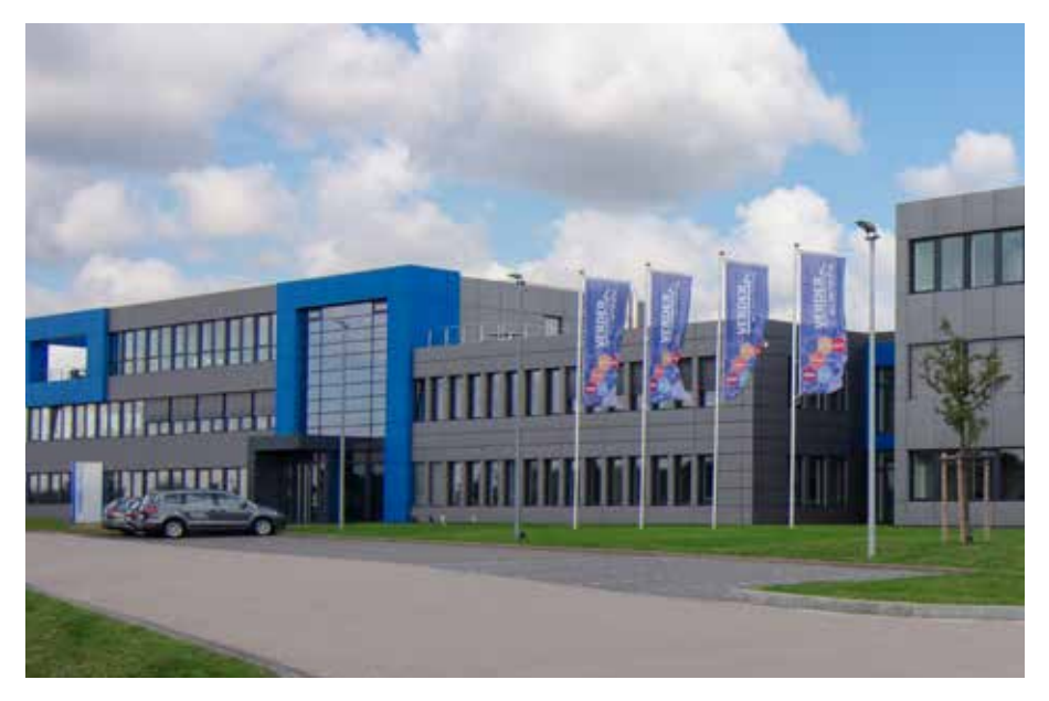
Eltra GmbH in Haan, Germany

ELTRA is part of the Verder Group since 2012 and consistently invests in research and development. With the introduction of the ELEMENTRAC series with powerful ELEMENTS software ELTRA offers analyzers for rapid and reliable O/N/H and C/S determination. These are characterized by modern design, convenient operation and integrated solutions for special applications, like our Dual Furnace Technology which allows analysis of both organic and inorganic samples with only one instrument – a unique concept only provided by ELTRA.